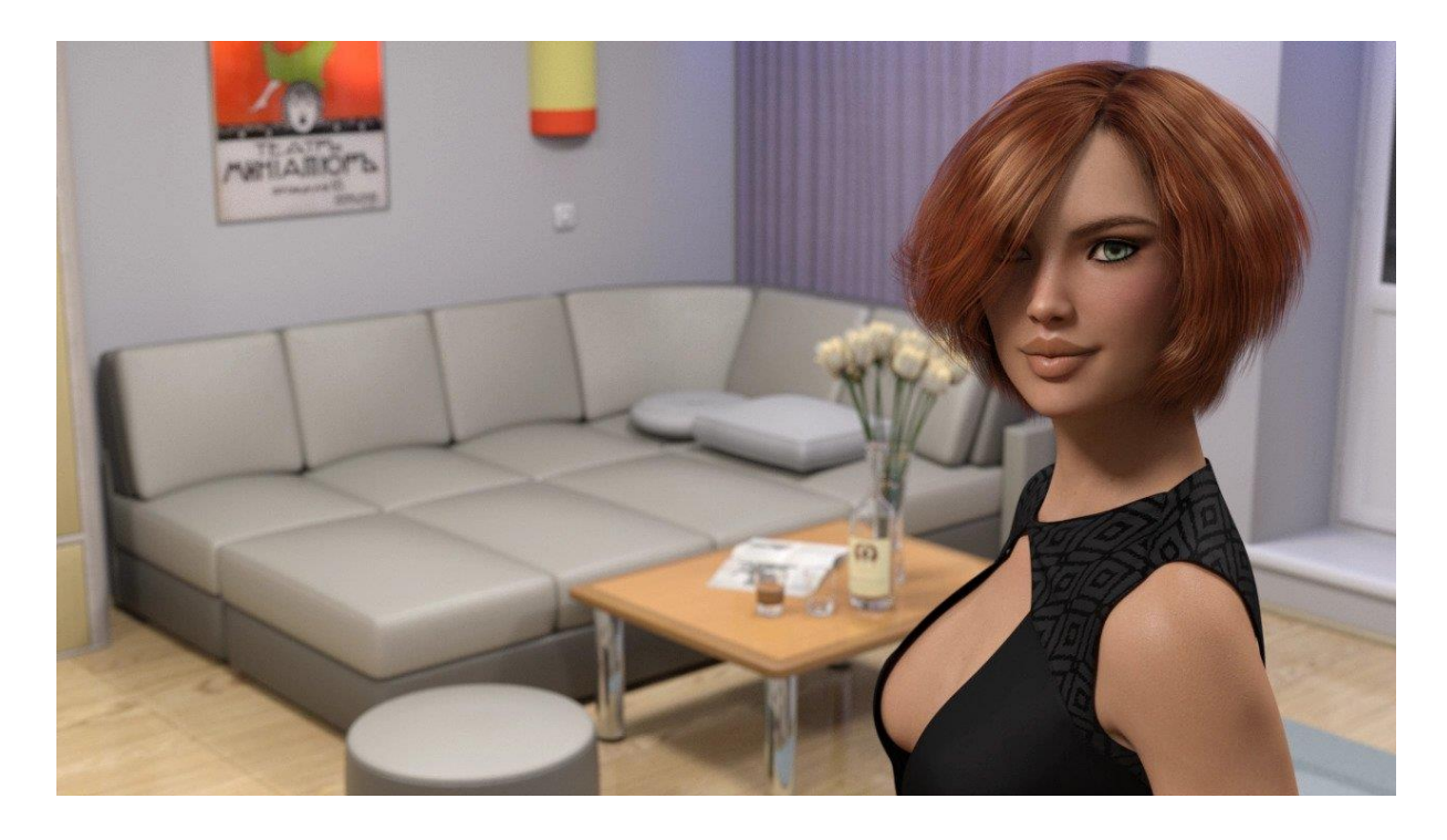
You NEED to choose " Rough way " on Day 13 if you want to see her content.

This character will first appear on Day 14. You will very soon understand that her relationship with Ann is not exactly the best, if you wish to know more about what happened between them, please check out our <u>comic</u>.