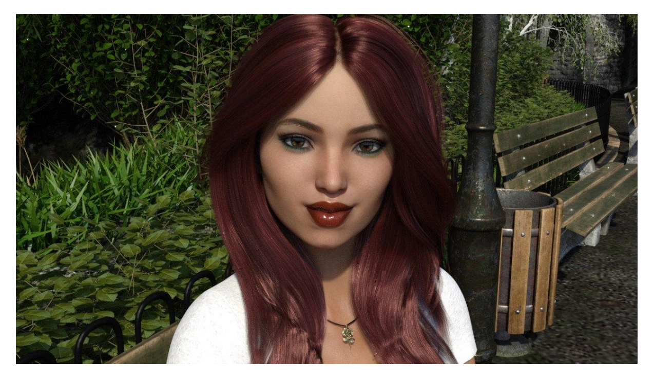
You NEED to choose "Rough way" on Day 13 if you want to see all her content.

Olivia is your classmate and she has two sex scenes in the game. First scene (at the party) is available even on the gentle way but you can't get the second one like that.